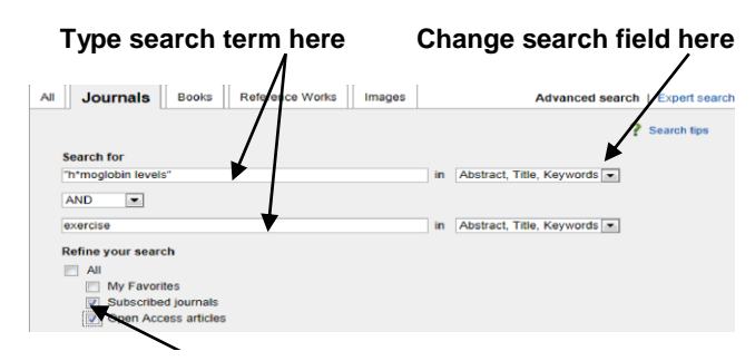
Change source here

wish to search. Click on the Search button to run your search.